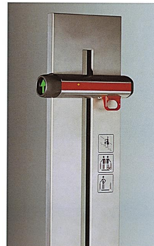
◀ Multifunction post

Options – A large number of variations and a wide range of options such as maintenance free piezoelectric contact mat, halogen free wiring, non lubricated chain, automatic hand-rail tensioning and permanent monitoring allow the fulfillment of customer requirements.