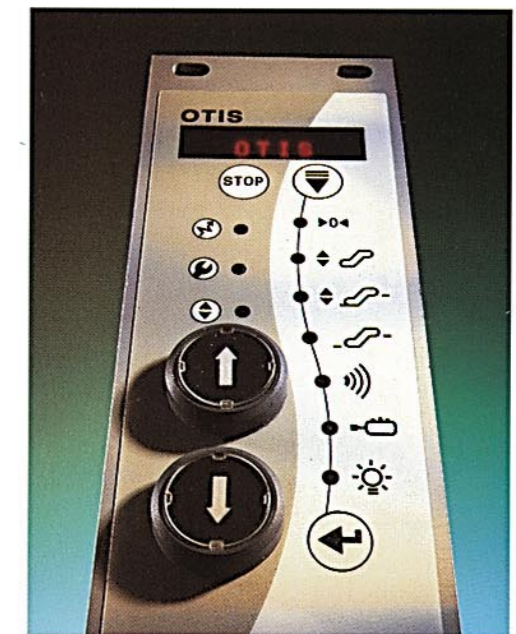
▲ Control panel

Otis 513 NPE’s advanced technology – such as the programmable logic controller or microprocessor controller with variable speed converter, control panel to check the actual working conditions, interfaces for remote monitoring and control – corresponds to customer’s requirements for safer operation, extended life time of components, even when facing heavy duty traffic, optimum availability and low operation cost requirements.