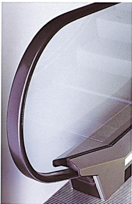
◀ Vertical glass balustrade

Design – Different balustrade designs allow optimal adaptations to the application and architecture.