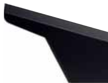
HANDRAIL ENTRY BOX

① Jet black, powder-coated steel (standard)