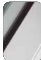
INNER AND OUTER DECKING