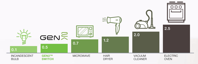
INSTALLED POWER (WATTS)

Gen2 Life is also available with the battery-powered Switch option, which enables it to operate during a power failure for up to 100 runs. The battery uses 230V single phase power from the grid or from renewable energy sources. Overall, the system requires less installed power than a household microwave.