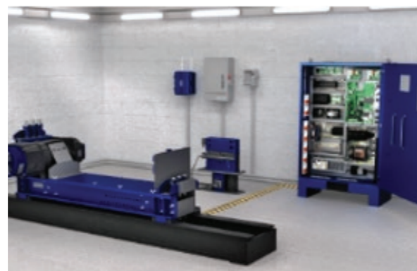
UPGRADE TO BELT TECHNOLOGY WITH GEN3 MOD