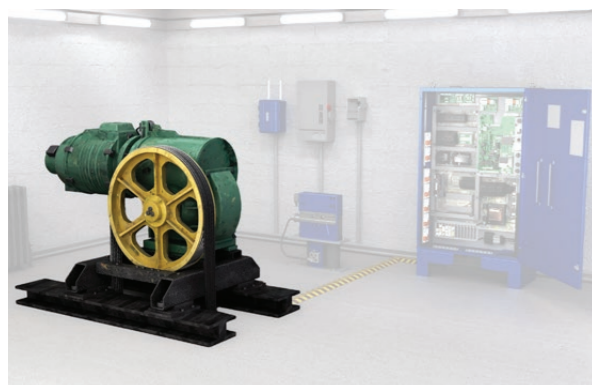
CURRENT ROPED SOLUTION